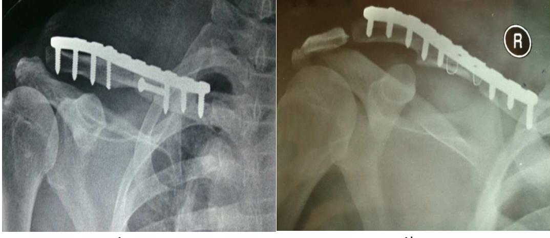
Figure – 1 : Post-operative assessment done with an AP radiograph.