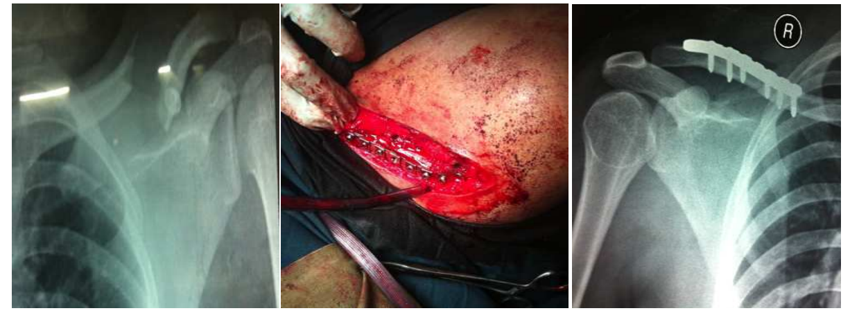
Figure – 3 : X-ray during pre-operative, intra-operative and post-operative periods.