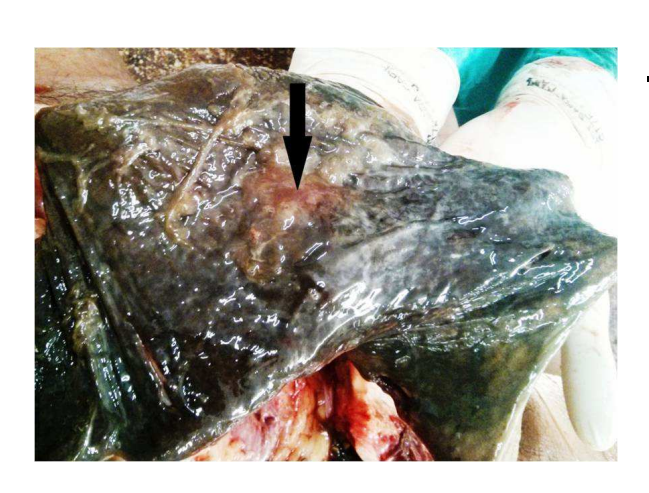
<u>Photo – 1</u>: Hemorrhagic spots on stomach mucosa along with grey discoloration.

While post mortem examination of this body was going on, our colleagues were doing another post mortem examination of a decomposed body in same examination room. As the decomposed body had been invaded with