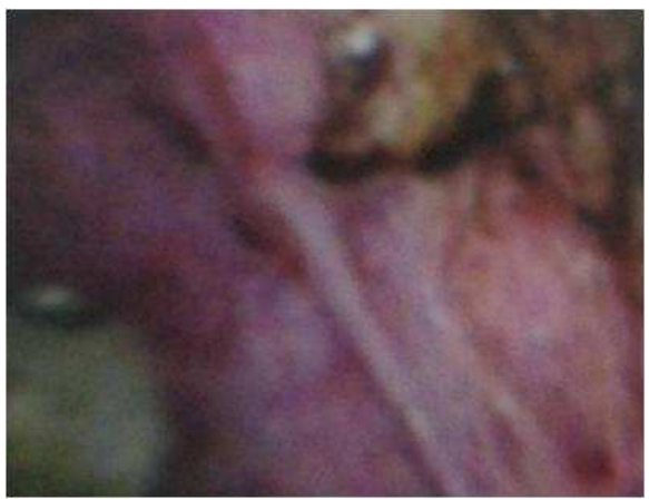
<u>Figure − 1</u>: Surgical photograph showing DIE.

The woman is under our follow up the ureteral stent removed and left hydroureteropephrosis cleared. HPE of the tissues reported as endometriosis. (Figure – 1, 2, 3, 4, 5)