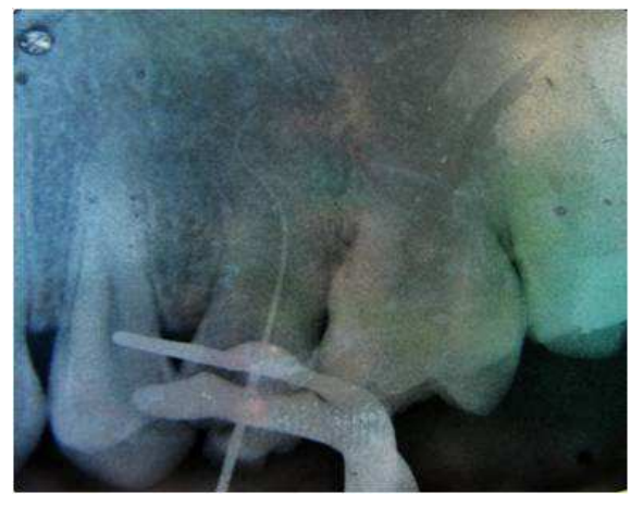
Figure - 3: Master cone radiograph.

Figure - 2 : Working length radiograph showing S-shaped root canal.