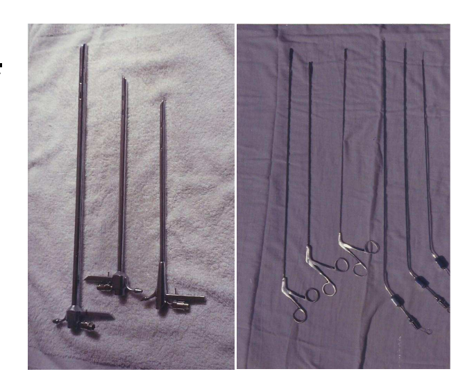
<u>Figure - 1</u>: Rigid esophagoscope and bronchoscope with forceps.

Post operative period – all the patient who underwent esophagoscopy and bronchoscopy did not have any procedure induced injury neither did have any post operative complications. All the patients were subsequently discharged.