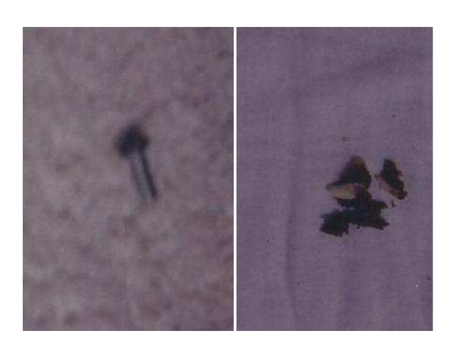
<u>Figure -2</u>: Airway foreign bodies after removal by rigid bronchoscopy.