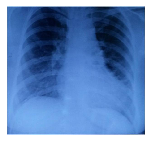
Figure – 1 : X–ray chest PA view shows cystic bronchiectatic changes in left parahilar region.

Based on history, clinical examination and an investigation, patient was diagnosed as a case of Bronchiectasis and Hashimoto's Thyroiditis (Autoimmune Thyroiditis) with multi-nodular toxic goitre.