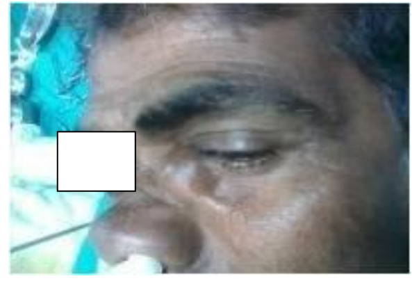
<u>Figure – 1</u>: Dacryocystocoele.

Females were noticed to have more nasolachrymal duct obstruction due to