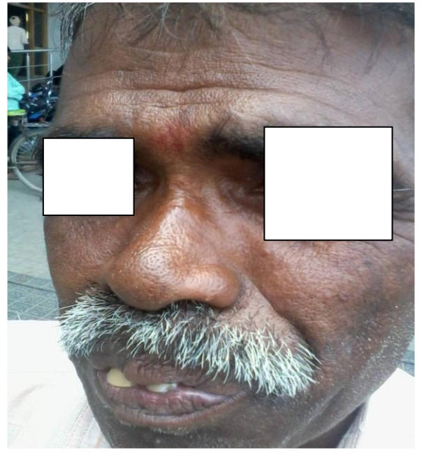
<u>Figure – 3</u>: Deviated nasal septum towards lacrimal fossa on left side.

<u>Figure – 2</u>: Postoperative 1 year after endonasal dacryocystorhinostomy.