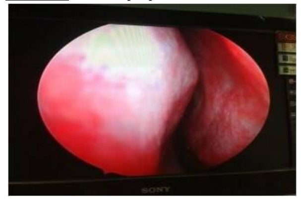
Figure – 5: Lacrimal fossa after septoplasty.