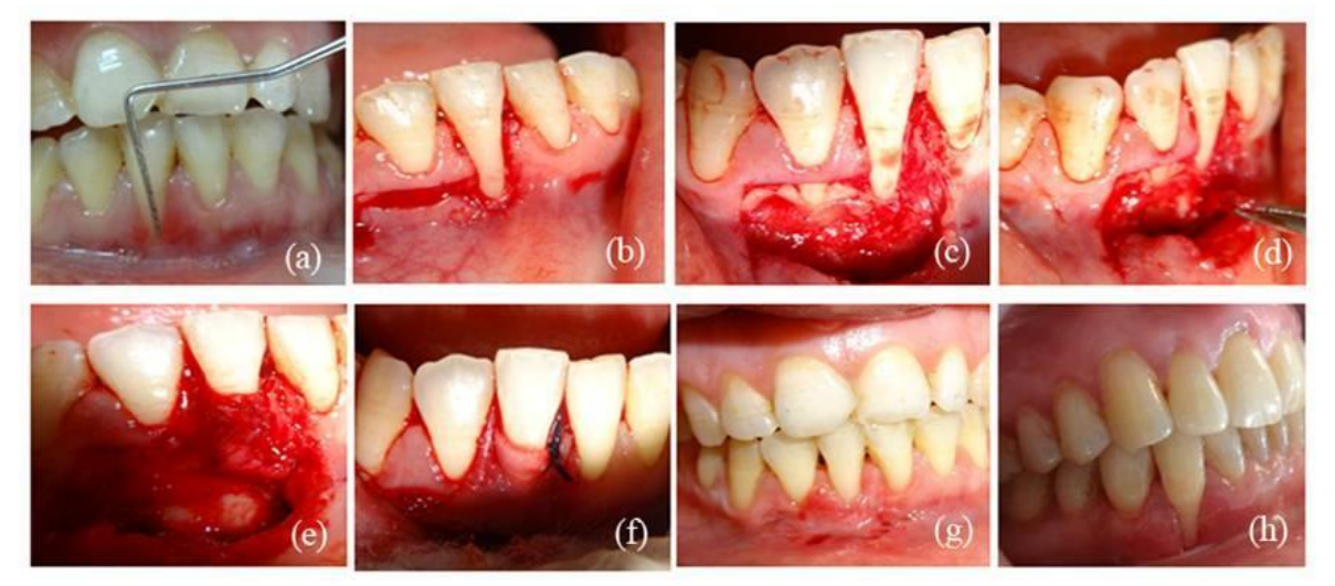
Figure - 2h: After 12 months.