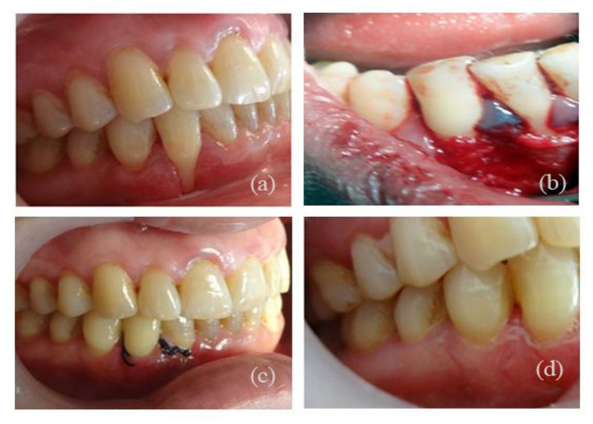
Figure - 3d: 12 months after suture removal.