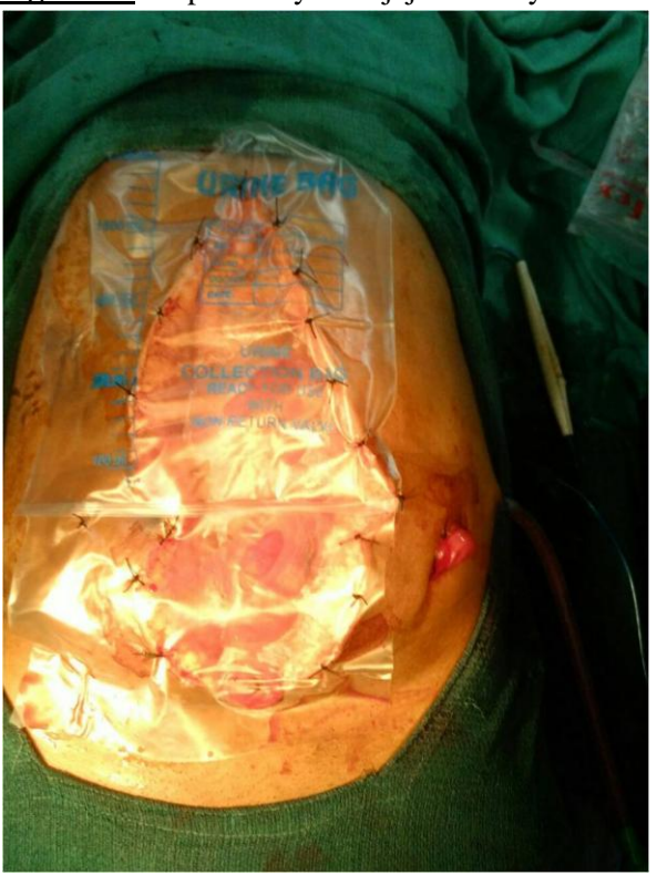
Figure - 7: Laprostomy with jejunostomy.

jejunum (Figure - 8), patient was managed conservatively, discharged later with anticoagulants. Suddenly 30 mins prior to admission patient was collapsed, patient was intubated outside and referred to our institution. GCS was E2M2VT on examination, Tachycardia, Hypotension (+). Abdomen was rigid. P/R was empty. USG of abdomen and pelvis demonstrated free fluid. Hemorrhagic fluid was aspirated under image guidance. Patient was started on i.v. fluids and antibiotics and resuscitated well. An attempt to restore the patient's volemic and electrolytic equilibrium has been made, but it was unsuccessful. 2 hour after presentation the patient succumbs.