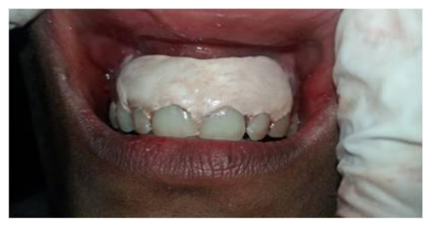
<u>Figure - 8</u> : Post-operative photograph.