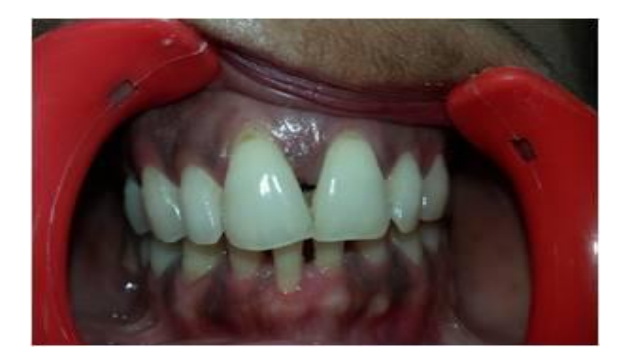
Figure - 1: Pre-operative photograph.

A 30-year-old female patient reported to the Department of Periodontics, D J College of Dental sciences and Research, Modinagar, with the chief complaint of loss of gums between the upper front teeth. On examination, there was a loss of papilla between 11 and 21 ( Figure - 1 ). A detailed medical and dental case history was recorded followed by scaling and root planning. After phase I therapy, surgical reconstruction of interdental papilla was performed followed by use of connective tissue graft and platelet rich fibrin.