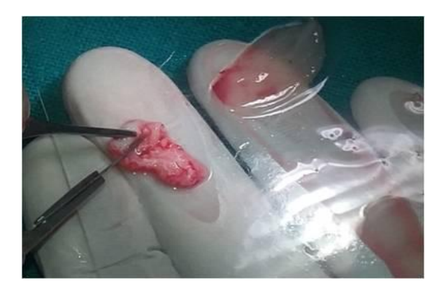
Figure - 12: Platelet-rich fibrin ready for use.

Figure - 11: Isolated Platelet-rich fibrin by separating the middle fraction from the centrifuged blood.