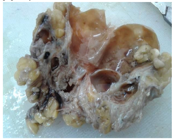
Figure - 2 : In situ papillary carcinoma of breast.

Figure - 1: Gross specimen showing intracystic papillary lesion.