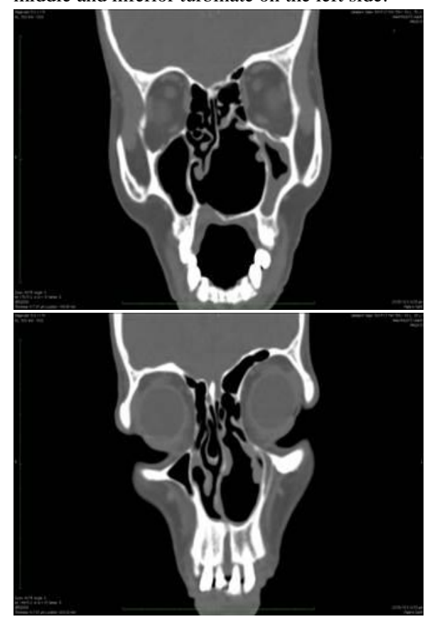
<u>Figure - 1</u>: CT scan showing destruction of middle and inferior turbinate on the left side.