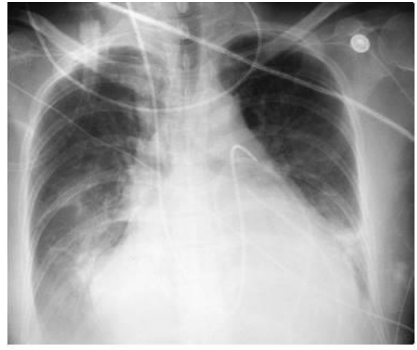
Figure - 2: Chest x-ray showing moderate tuberculous pericardial effusion with minimal pleural effusion.

Gross appearance was serous in 15 patients (50 %) serofibrinous in 6 patients (20%), haemorrhagic in 6 patients (20%) and purulent in 3 patients (10%). It was predominantly serous and serofibrinous in tuberculosis; purulent in pyogenic, hemorrhagic in malignancy and chronic renal failure ( Figure – 2, 3 ).