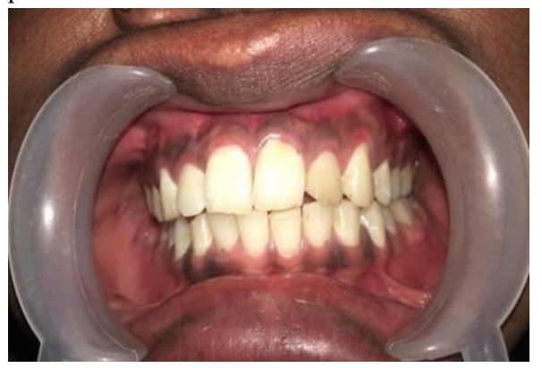
Figure - 1: Showing a clinical picture of the patient.

A 35 year old female patient reported to the Department of Oral Medicine and Radiology, Sri Sai College of Dental Surgery, Vikarabad, Telangana, with a chief complaint of swelling followed by pain in the upper left front tooth region for 4 days. She had reported 2 years back with a similar complaint for which the patient had undergone necessary treatment including Root Canal Therapy 21, 22 followed by surgical enucleation of the palatal cyst for 22, 23, 24, 25. He had a habit of nail-biting. Extraoral examination showed that a diffuse extraoral swelling on the left middle third of the face of size 3 \times 2 cm extending anteroposteriorly from the left ala of the nose to about 3 cm in front of the tragus of the ear and superior-inferiorly from 1 cm below the inferior border of the orbit to 1cm below the ala- tragus line. There was an obliteration of the nasolabial fold seen. On palpation, the swelling was soft in consistency, tender, compressible. non-reducible. and nonpulsatile. Intraoral examination showed discolored teeth 22, 23, and the tooth was tender on percussion 21. A provisional diagnosis of an infected Periapical cyst was made. Clinical differential diagnosis included periapical abscess and apical periodontitis (Figure -1).