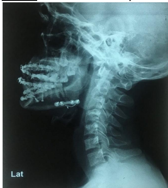
Figure - 3: Lateral view of neck X-ray.

Postoperative OPG ( Figure – 2 ) showed adequate reduction and fixation of both fracture sites, but the tooth which was present in the line of fracture in the right angle fracture was found missing.