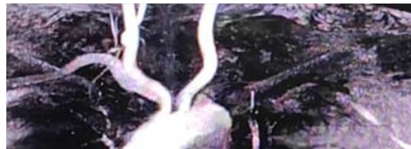
Figure – 1: MR angiography showed occlusion of left subclavian artery.

Routine investigations like CBP, CUE, LFT, RFT, USG abdomen and pelvis, chest X-ray, ECG were normal. 2DECHO: mild concentric LVH. MRI brain – normal.