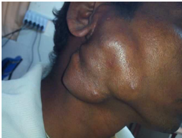
Photo – 1: Well-defined swelling on the right side of the face in the parotid region.

Plain and contrast-enhanced scans with axial and coronal sections revealed a multifocal, mild peripherally enhancing conglomerated lesion of size approximately 74×68 mm in axial plane is seen involving the right parotid gland. (Photo – 2) Bilateral lung field showed multiple soft tissue nodular lesion of average size 10×12 mm, suggestive of metastasis. The overall features were suggestive of a mass lesion involving right parotid gland along with preauricular soft tissue nodular lesion. There was presence of multiple lung metastases.