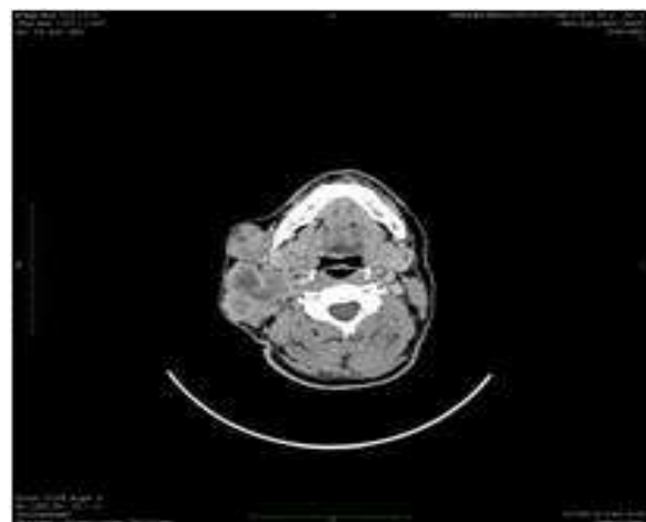
Photo – 2: CECT showing large infiltrative soft tissue mass in the parotid region of the right side of the face.

[9, 10, 11]. Smears were stained with H&E stain (Hematoxylin and Eosin) and Papanicolaou stains. The diagnosis was made on smears stained with H&E stain as these showed the characteristic findings of hyaline globules surrounded by the neoplastic cells forming a cell ball. (Photo – 3) These globules stained pale with Papanicolaou stain and were virtually invisible. Individual cell cytology showed cells with small ovoid nuclei, mild to moderate pleomorphism and hyperchromasia and prominent nucleoli. (Photo – 4) Cells appeared in small groups, tight clusters and plugs, while some were seen encircling the hyaline globule. Overall features were that of ADCC.