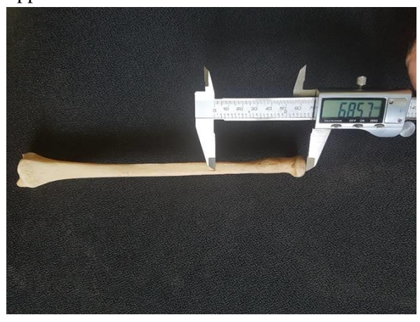
Figure – 4: Distance of nutrient foramen from lower end.